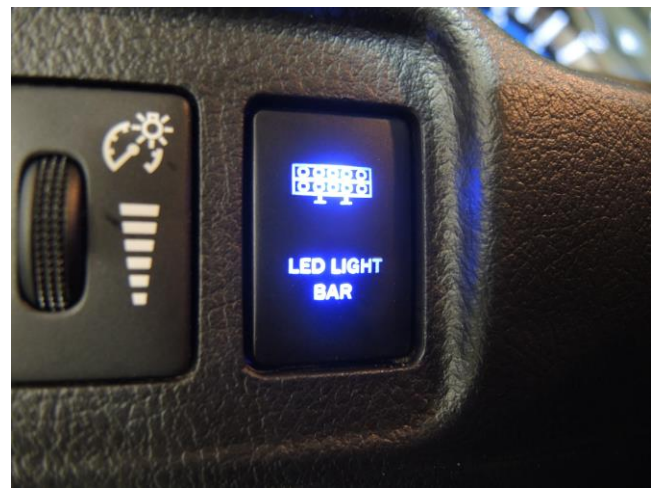
Switch engaged and illumination on (step 4B)