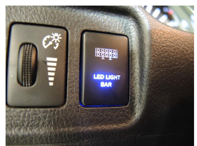
Switch operation verified with illumination (step 4A)