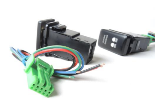
Wiring instructions (Step 3)

If the switch is engaged and illumination is on the switch should light up as shown in Step 4B.