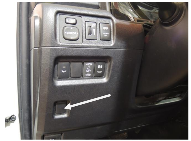
2010+ 4Runner location shown that isn't compatible (Step 1)

Known Compatibility Issue; 2010-Current 4Runner - the switch you purchased isn't compatible in this location (as shown).