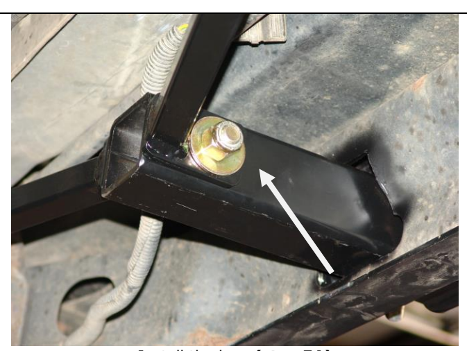
Install the legs (step 5A)

Note; the bolt heads are installed in the inside of the receiver (photo 5A).