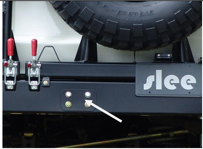
Mark cross member & bolt location (Step 2)

Mark the cross member and bolt hole locations through the Slee Rear Bumper (photo 2) to be cut and drilled.