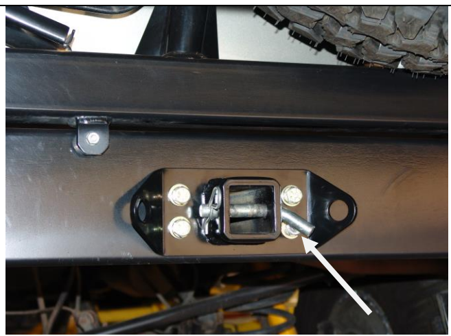
Install the receiver (step 4)

Note; the nut plates are installed inside of the cross member.