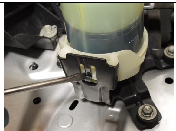
Un-clip reservoir front bracket (Step 3A)

Separate reservoir from bracket and remove bracket by removing three bolts as shown. Discard bracket and three bolts.