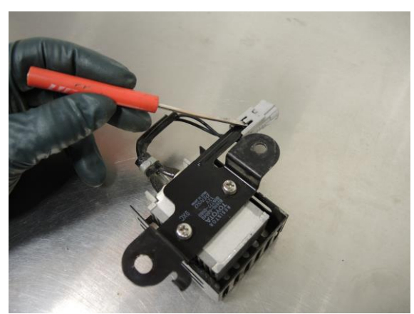
Remove connector from bracket (Step 2B)