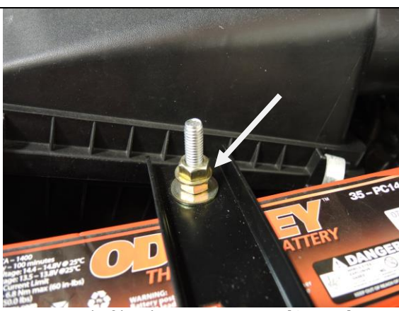
Detail of hardware orientation (Step 7)