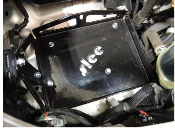
Mount tray (Step 5)