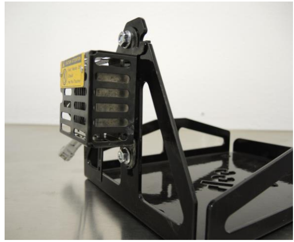
Mount DRL resistor to Slee tray (Step 2C)