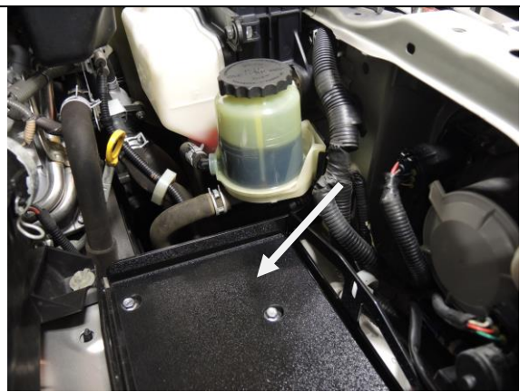
ABS riser installed (Step 6)

7. Install battery, J-Bolts and battery tie down bracket. Tighten Slee Battery Tie Down Bracket with USS Washers (larger OD washers) and nuts.