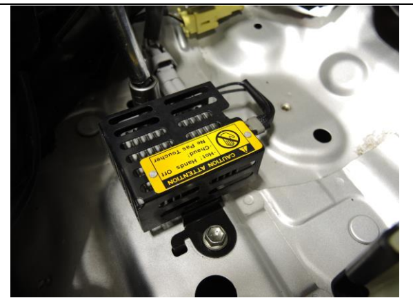
Remove bolts and unplug harness (Step 2A)

2 x M6 x 10 Flange Head Bolts 2 x M6 Flange Nut