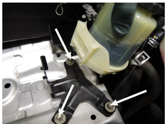
Remove reservoir and bracket (Step 3B)

4. Install Power Steering bracket to Slee Battery Tray with the supplied hardware.