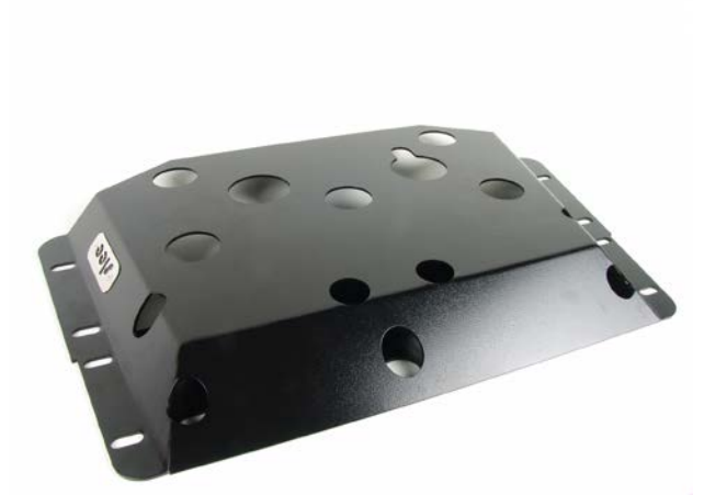
Prepare for the installation (Step 1)

Note ; Installation could be performed without a lift or jack(s) if proper safety precautions are executed.