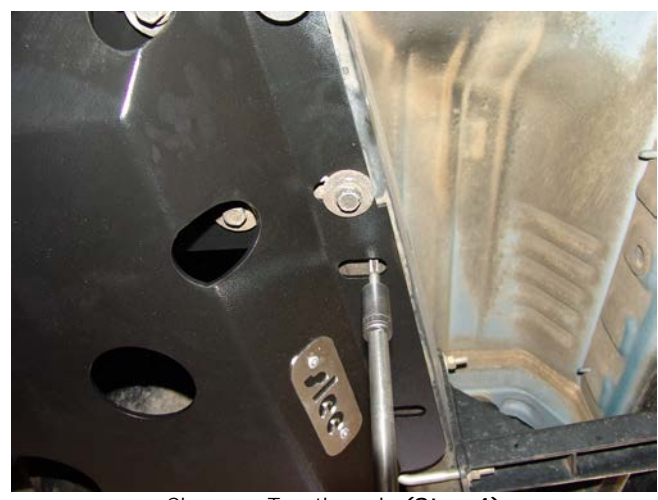
Chase or Tap threads (Step 4)

Properly lift and install the Slee Belly Plate Skid with the factory retained and supplied hardware.