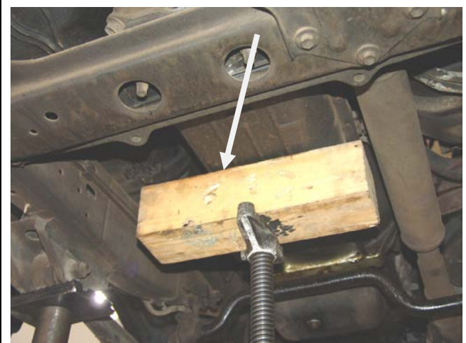
Supporting the transmission (Step 2)

Properly support the transmission using a jack and a block of wood (to protect the transmission pan). It isn't necessary to jack the transmission up. The purpose is to provide support once the cross member is removed.