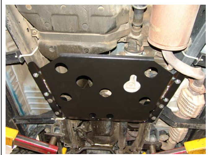
Installation complete (Step 5)

Hint ; The holes in Slee Belly Plate Skid will allow the user to drain and fill the transfer case without removal of the Skid Plate. The holes will also make it easier to remove mud, snow, etc.